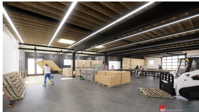
Renderings show the Center's functional use of the combined workshop space.